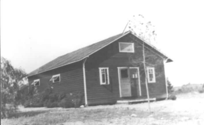
FREMONT SCHOOL-Located on Palo Verde & Fremont in Montclair

February 25, 1916 – a partial list of Board approved supplies from Cunningham, Curtis & Welch: Spelling Blanks – 130 dozen; Blotters – 40 pounds; Cactus Clips – 8 dozen; O.K. Fasteners – 4 dozen; Crayolas – 3 gross; Rubber Bands – 2 pounds; Newsprint – 2,100 pounds, assorted sizes.