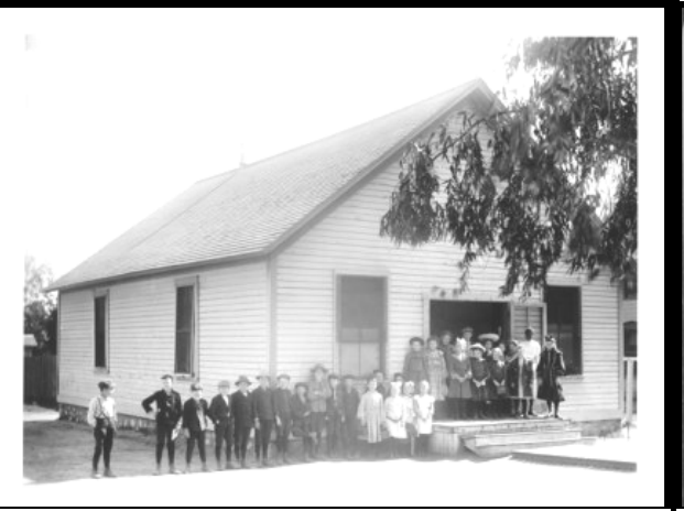
BLACKBURN SCHOOL -Located on the east side of Euclid between C & D Streets, Ontario